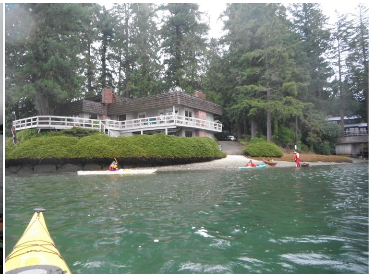
Oyster Bay (Dec 17).