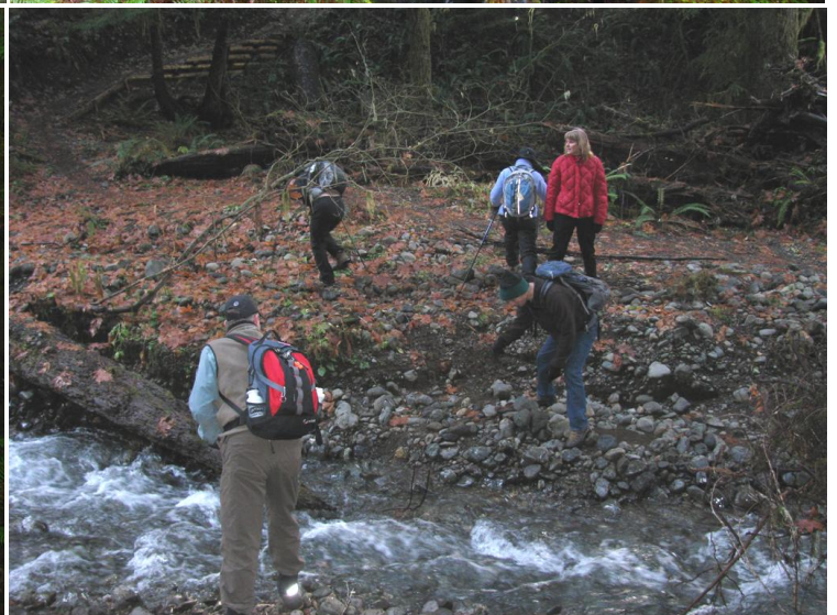
South Fork of the Skokomish River (Dec 8).