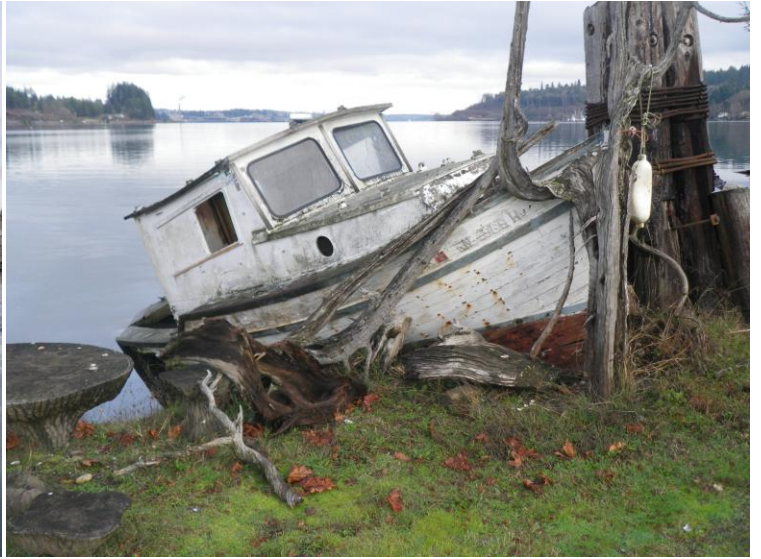
Sinclair Inlet (Dec 7).