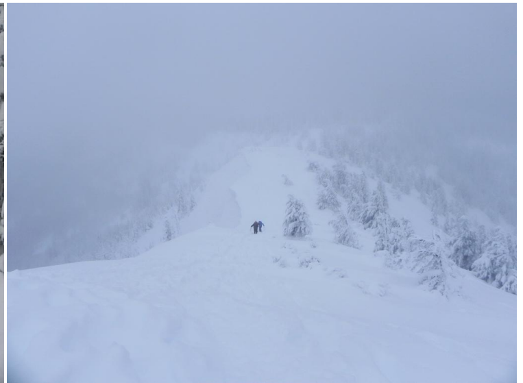
Hurricane Hill (Dec 9). Photos by Isaac Sun