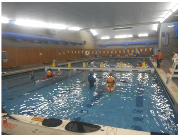
Kayak Pool Skills Session (Nov 25).