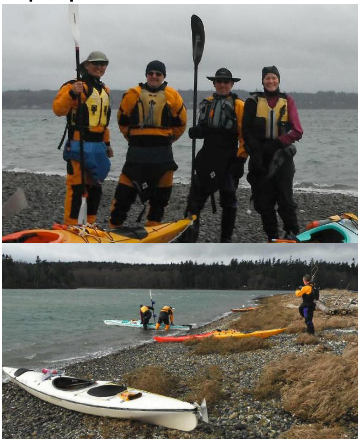
Windy Day Practice, Hoods Head (Feb 18), Photos by Isaac Sun