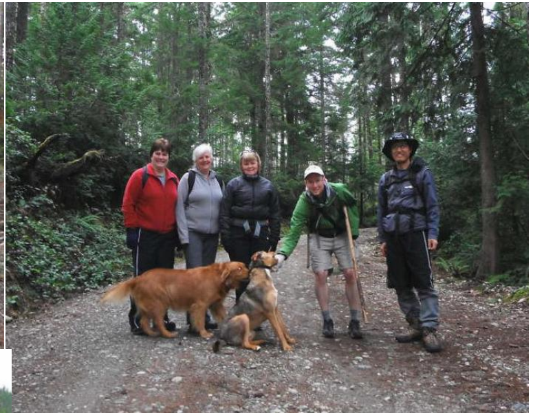
Half-Day Hikes with Isaac (Feb 4, 19, and 25, respectively)