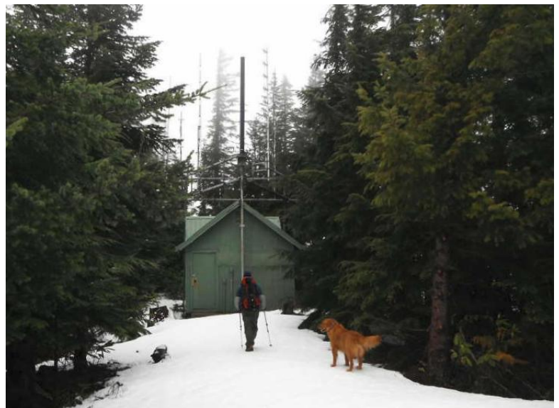
Buck Mountain (Feb 17), Photos by Isaac Sun