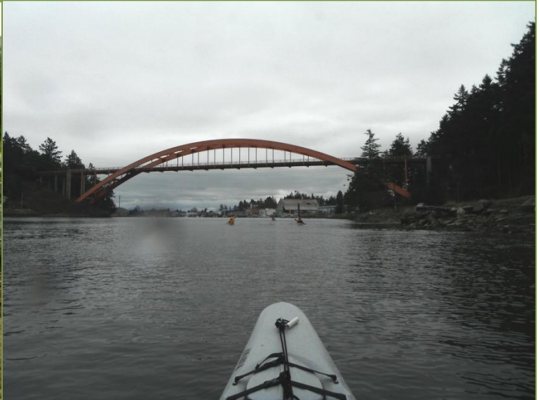
Skagit Delta (March 4)