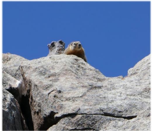
Sunshine Trip Part I: Getting to the Canyonlands.