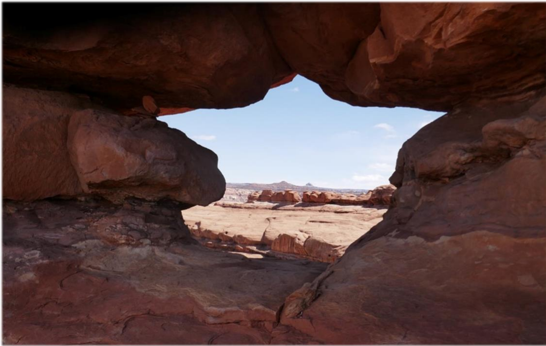
Sunshine Trip Part II: Canyonlands. A magical place worth visiting, hiking, and exploring.