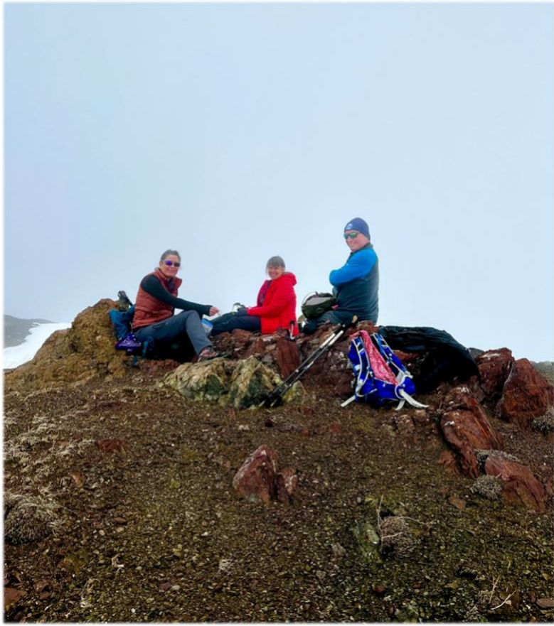
Slab camp to Blue Mountain!