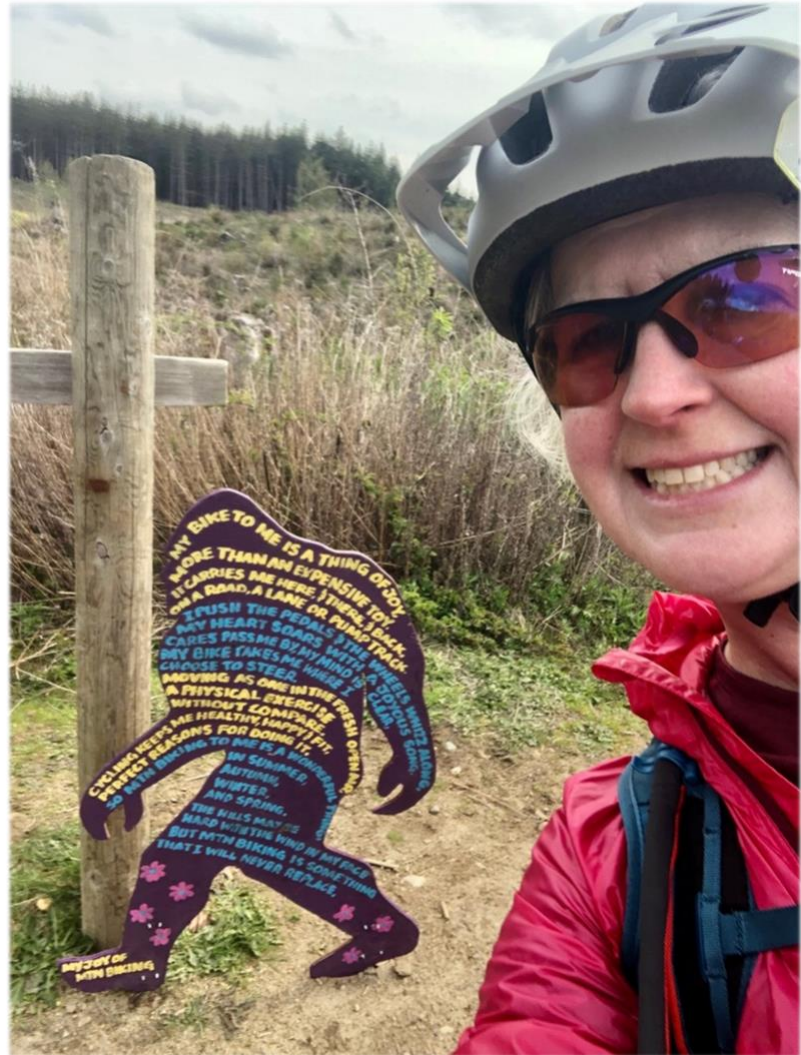
Fun gravel bike ride at the Gamble Graveler with Sasquatch sightings, sunshine, friendly people, food and easy to follow routes.