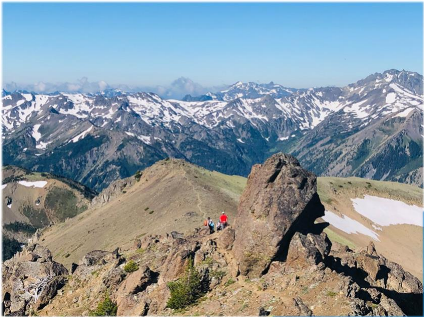
3 Days Buckhorn Pass, Marmot Pass and Heather Creek.