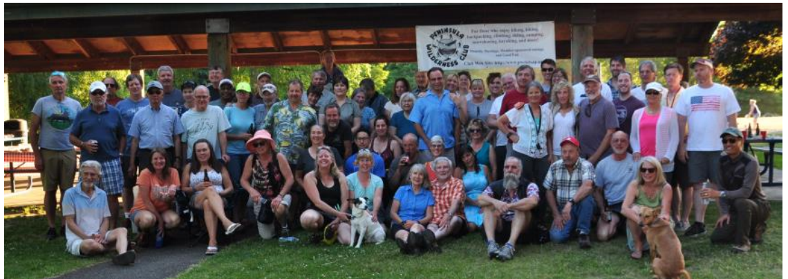
2017 Group photo