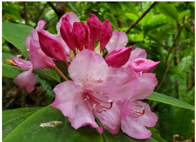
Dosewallips Rhody in Bloom

We strongly encourage carpooling and ride-sharing to reduce impact to trailheads, minimize our environmental footprint, and reduce costs. Please be considerate of your drivers, including situations when you ride with different drivers in each direction. The amount you contribute to your driver should reflect the distance driven, the cost of gas, tolls, and parking fees.