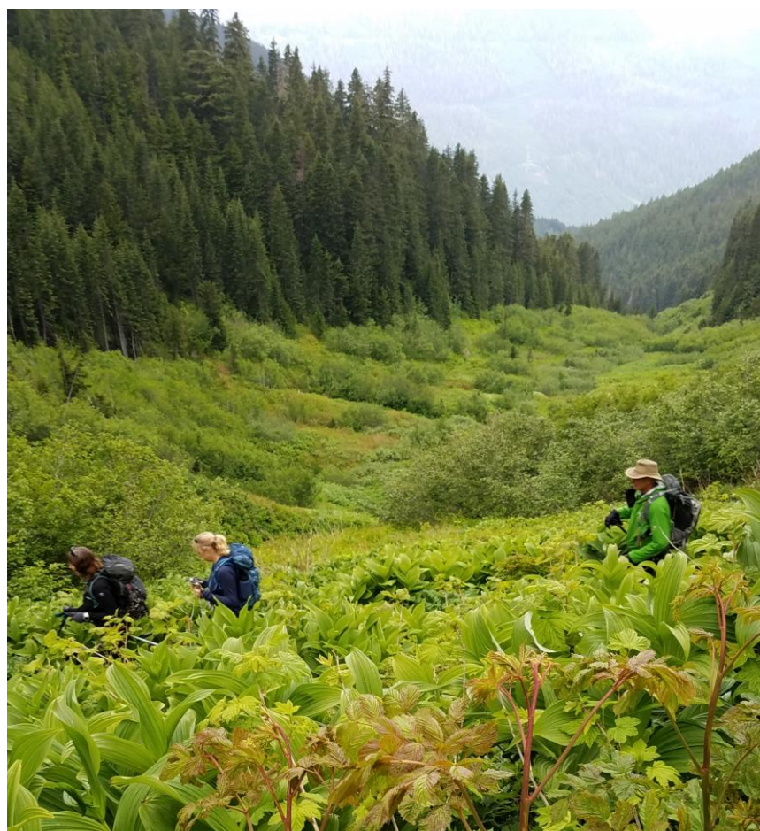
Hidden Lake – Paul Gervais, 6/22/2019