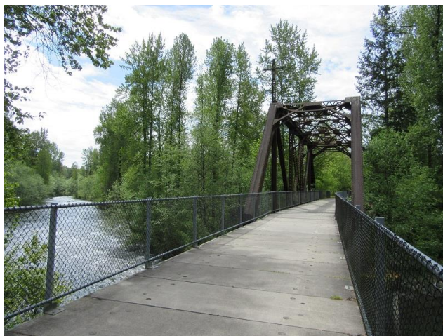
Cedar River Trail near Renton