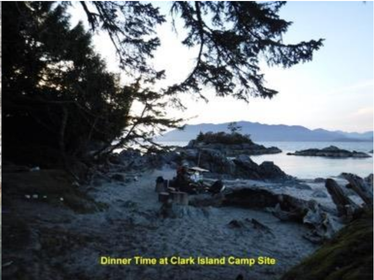
Dinner Time at Clark Island Camp Site