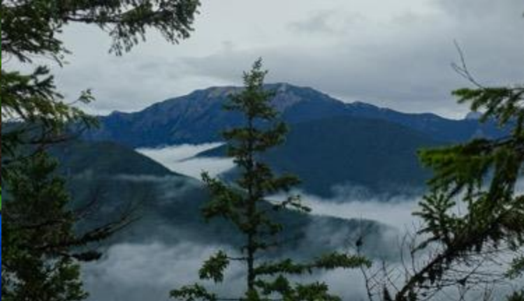
Tubal Cain & Tull Canyon – Osburns & Co.