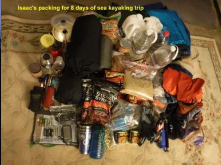
Isaac's packing for 8 days of sea kayaking trip