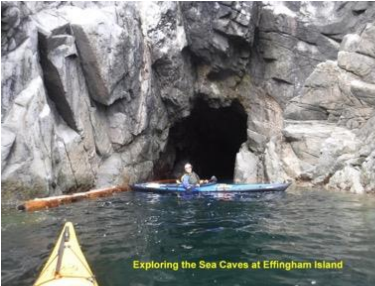
Exploring the Sea Caves at Effingham Island