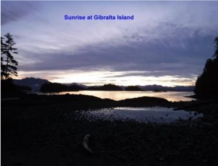
Sunrise at Gibraltar Island