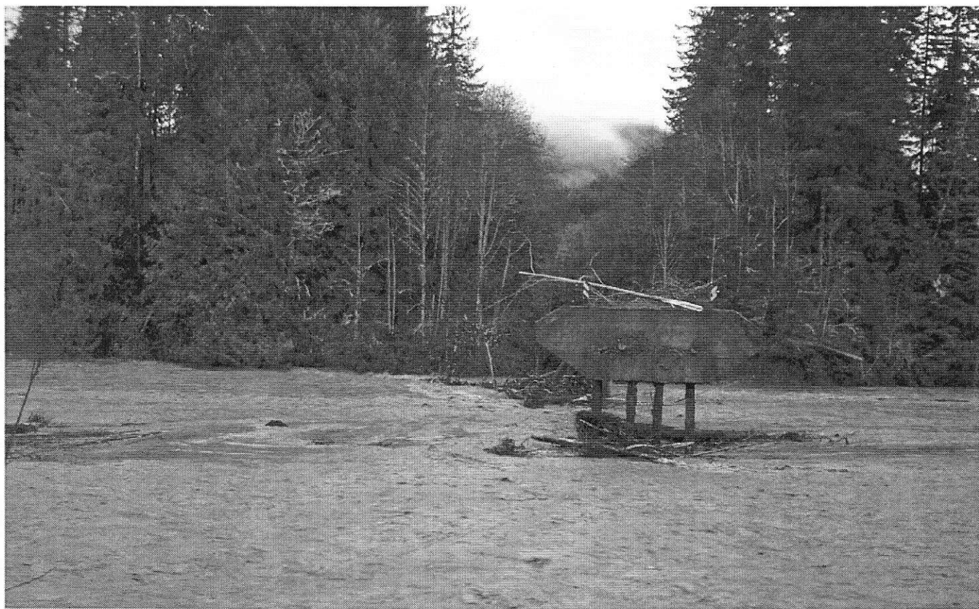
Washed-out bridge over the Nisqually River on 1 Road. This road is the only public access to the MTTA South District.

Illahee Preserve is an approximately 700-acre wildlife park located in the most populated part of Kitsap County. It is bounded on the north by McWilliams Road, on the south by Riddell Road, on the west by Almira, and on the east by Puget Sound. This treasure of a county park is managed and maintained almost entirely by volunteers. It is some of this maintenance that I hope to accomplish with work parties of PWCers. These will be short (half day or evenings when the days get longer), focused and low tech. I would expect them to occur about once a month. Examples would include: spreading wood chips on the trails, draining certain puddles, minor trail repair and trash patrol. If you are interested, please email me at dboyle@web-o.net , or if you don't have email, call me at 360-792-1714. I will notify everyone who responds with date, time and project to be accomplished.