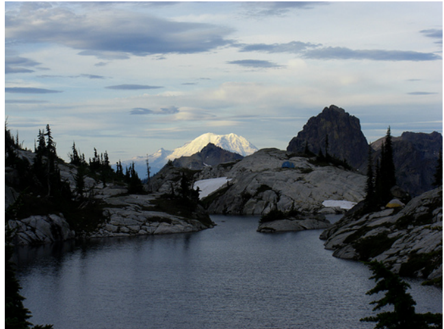
Tuck and Robin Lakes

(Edit: This is now going to be a day-hike. People have expressed interest in going but can only do a day-hike. As of Aug 18 there are 4 of us going.)