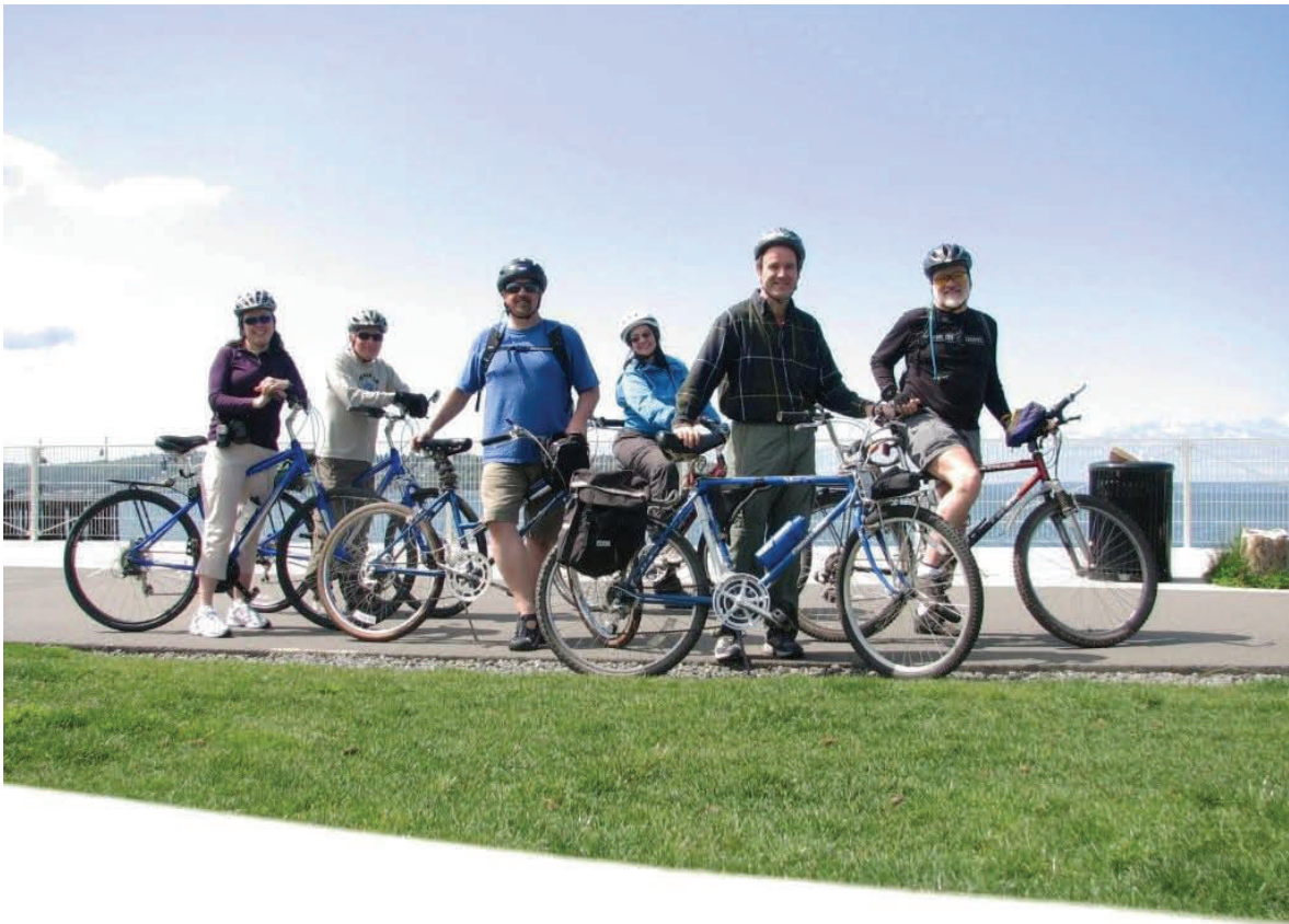
Photos from the Pre-Mother's Day Pub Pedal in Seattle, courtesy of Steve Osburn.